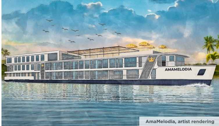
AmaMelodia, artist rendering

7-night river cruise | June 18-25, 2025 | aboard AmaMelodia